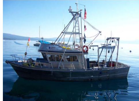
"RV John LeConte"